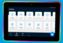
With LED Lights