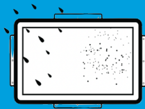
IP65 Front Glass